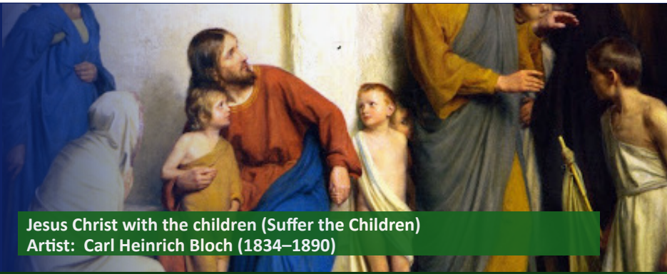
Jesus Christ with the children (Suffer the Children) Artist: Carl Heinrich Bloch (1834-1890)