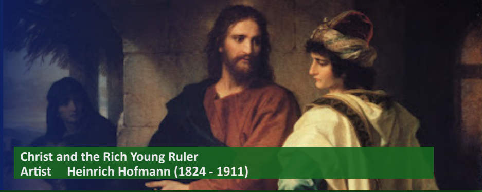
Christ and the Rich Young Ruler Artist Heinrich Hofmann (1824 - 1911)