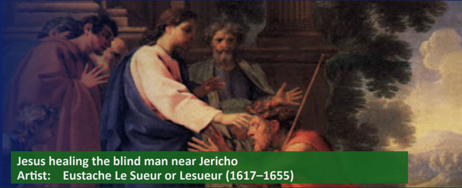
Jesus healing the blind man near Jericho Artist: Eustache Le Sueur or Lesueur (1617–1655)