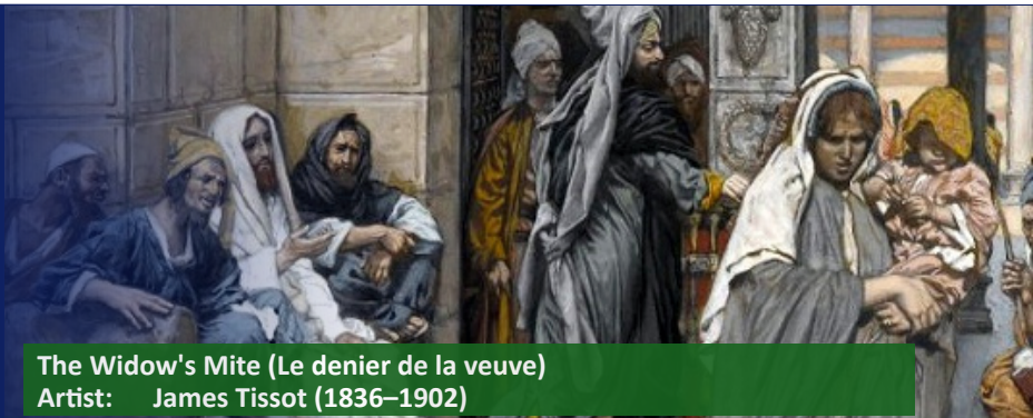
The Widow's Mite (Le denier de la veuve) Artist: James Tissot (1836-1902)