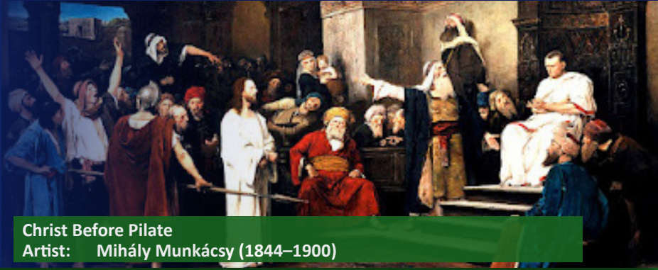
Christ Before Pilate Artist: Mihály Munkácsy (1844–1900)