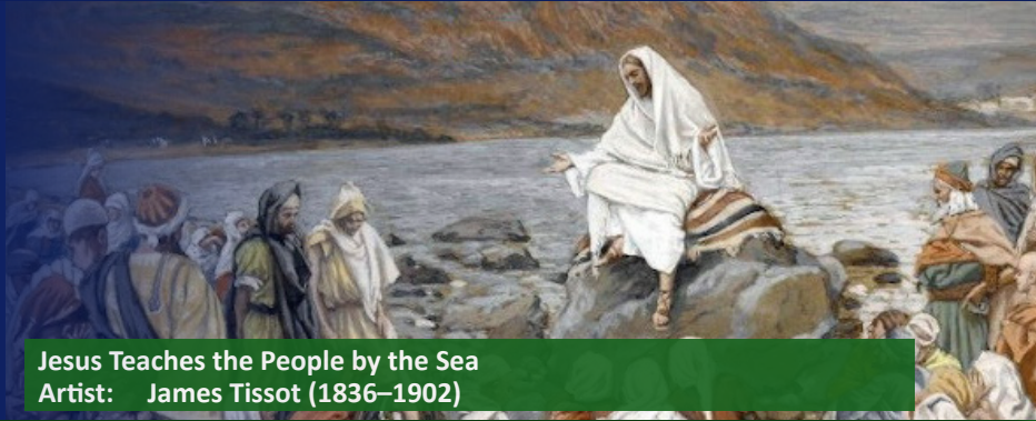
Jesus Teaches the People by the Sea Artist: James Tissot (1836–1902)